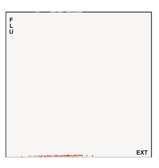
Figure 2. A Dot-Plot image of the COPAS software showing live animals treated with stain displaying auto-fluorescence only.