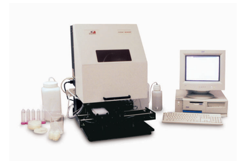
Figure 1. Picture of the COPAS BIOSORT System

Prepare a 10 \mu M dye stock solution (10X) of Molecular Probes SYTOX Green nucleic acid stain. Wash animals off agar medium using M9 buffer with 0.01% Triton X-100. In the event of heavy contamination of the culture or if liquid medium is used, the sample should be passed through an 180 \mu m nylon mesh to remove larger clumps of eggs and debris (See Sample Preparation Protocols SPB01 and SPB02 for details). Pellet worms by centrifugation (at low speed) or by settling, decant supernatant, and re-suspend in 15ml of M9 buffer.