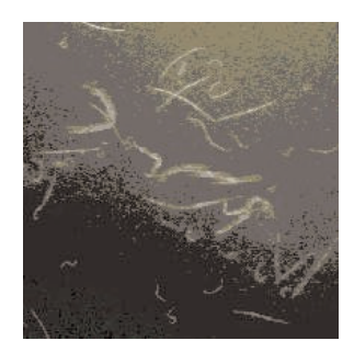
Figure 6. Microscopic image of a mixed C.elegans population.