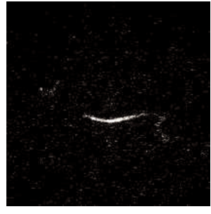
Figure 5 . Fluorescent image of a dead C.elegans