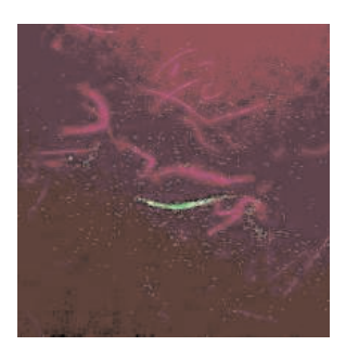
Figure 7. Overlay of Figures 5 & 6.